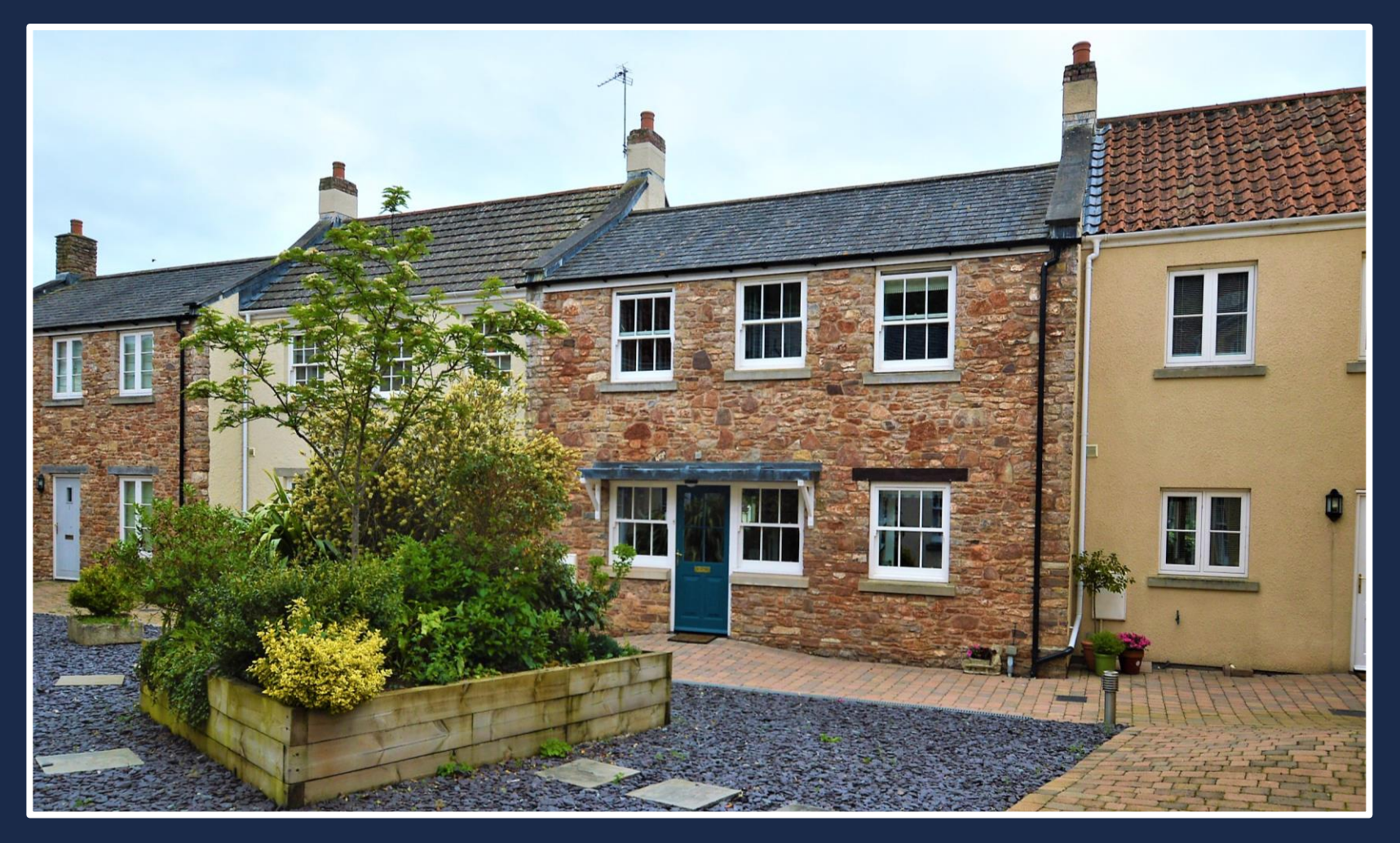
3 Reads Garden, Axbridge, Somerset, BS26 2FL